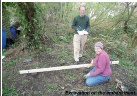
Excavation on the embankment