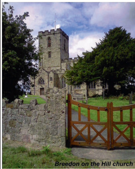
Breedon on the Hill church