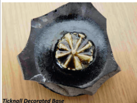
Ticknall Decorated Base

When unfortunately the rain did start, we took refuge in the very smart white headquarters tent. On one side of the tent were piled some of the over 100 crates of pottery recovered so far this year. Continuous processing of the finds was obviously essential.