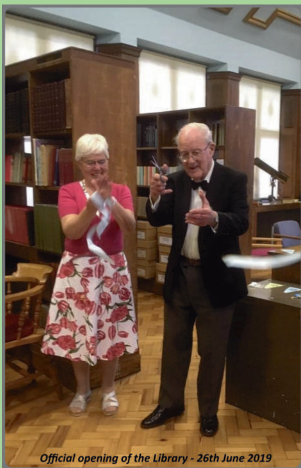
Official opening of the Library - 26th June 2019